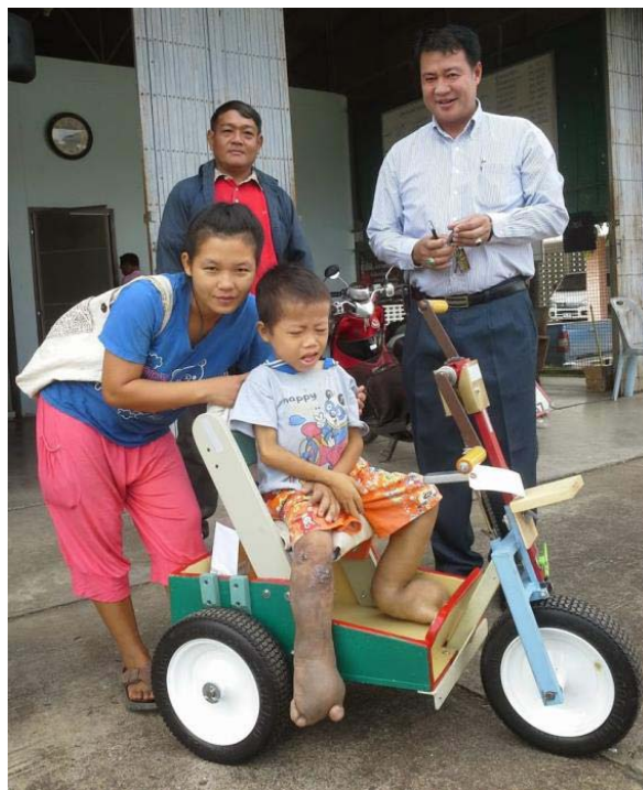
Thai boy and family have freedom with a PET.

Our current waiting list includes another 300 disabled persons who will hopefully receive new wheelchairs no later than December 1st ..... We thank you all for helping us provide mobility to Thai disabled persons...."