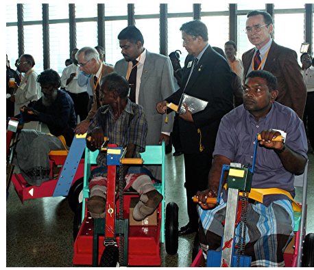
Sierra Leone shop setup and training. First production.